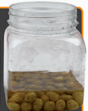
Allow to stand overnight, and check consistency periodically.