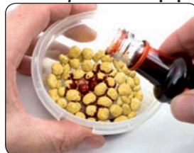
2 Pour on food colouring such as cochineal. Bait dye can also be used.