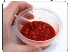
5 They perform best when soaked, so simply add water/flavour to the coloured Skinz.