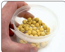
1 Place some soaked Skinz in a dry bait tub or small pot.

If you want to pep up their visual attraction they can be coloured with bait dye or food colouring.