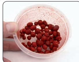
4 The Skinz are now evenly coated and ready to hook.