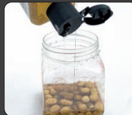
Cover with your chosen oil-based bait additive such as salmon oil or cold pressed hemp extract.