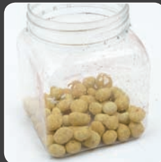
Drop a handful into screw-top glug pot.

Skinz will also absorb oil-based liquids, though these take longer to penetrate the outer coating.