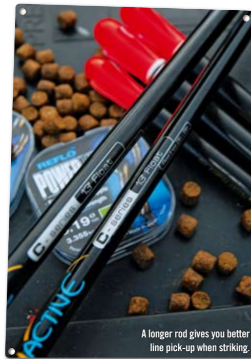
A longer rod gives you better line pick-up when striking.

I know exactly what it takes to get a bite, but I see so many anglers still get it wrong because they just don’t think about it. They chuck the waggler out and it dives so deep they have more chance of spearing one than hooking it, and this now