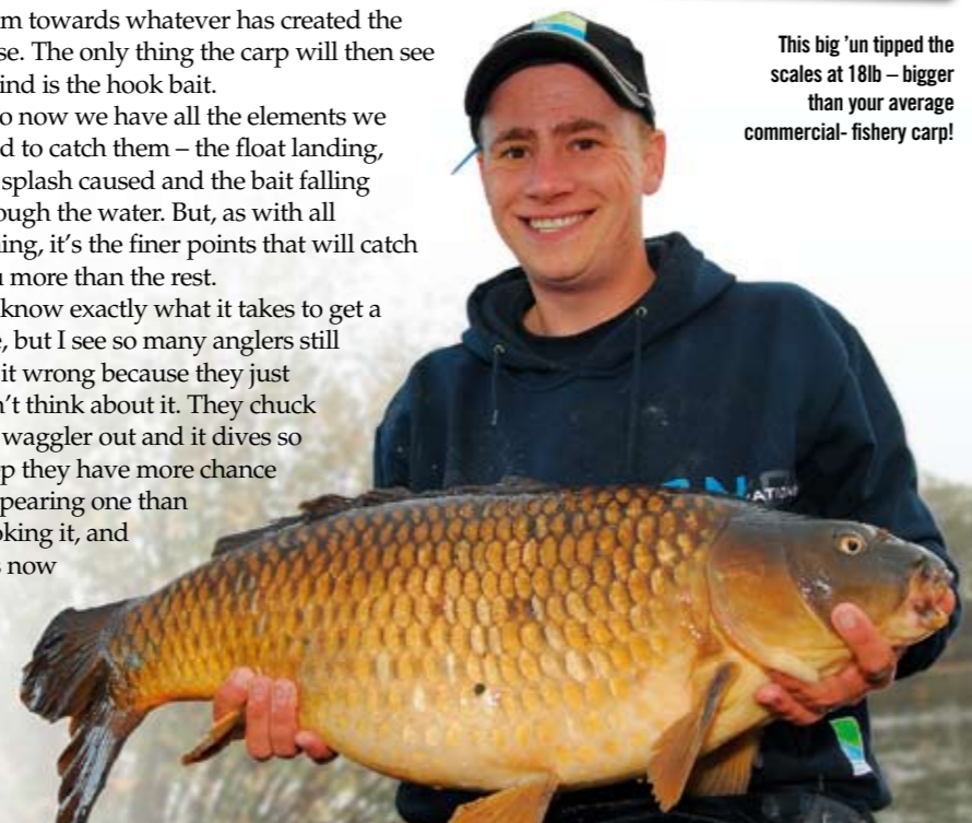
This big 'un tipped the scales at 18lb – bigger than your average commercial-fishery carp!

In winter, 99 times out of 100 you feed absolutely nothing!