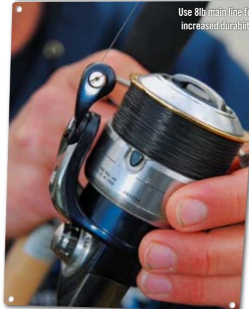
Use 8lb main line for increased durability.